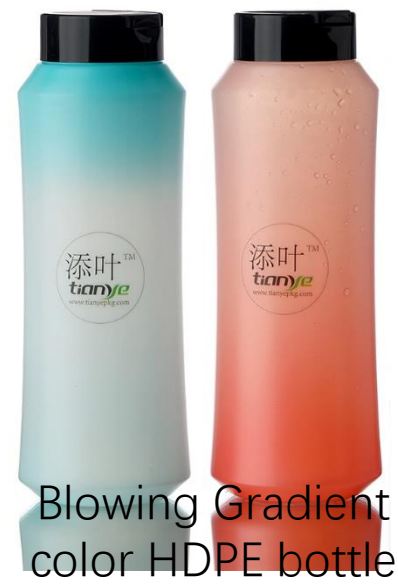
Blowing Gradient color HDPE bottle