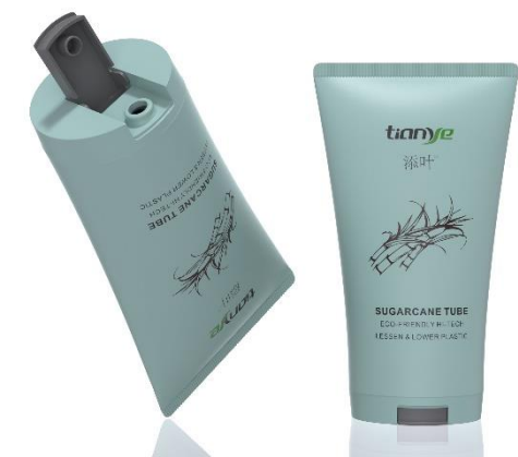
Sugar cane tube