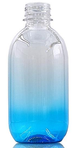
Blowing Gradient color PET bottle