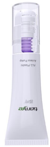
Mono material tube